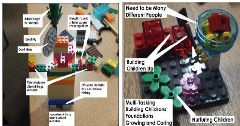
Figure 1: Pre-Service Primary Teachers' Teacher Identity

The participants in this workshop were trainee teachers. All had completed voluntary terms within primary schools prior to their training. Each of the students had at least some experience within primary schools as part of their Initial Teacher Training as well as some time spent as volunteers prior to their training. Participants were asked to build a model of 'Who you are as a teacher' furthermore, they were asked add a single small red brick to identify their greatest strength and write three phrases which characterised their models. Some results are shown below.