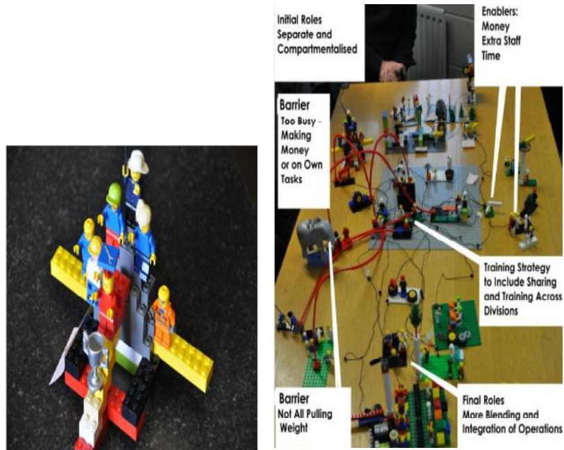
Figure 4: SME Employees' Individual Aspiration and Shared Vision